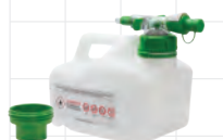
Jerry Can, Safety Spout & e-NRG bottle adaptor