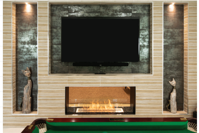
Flex 50DB (SIDE 2)