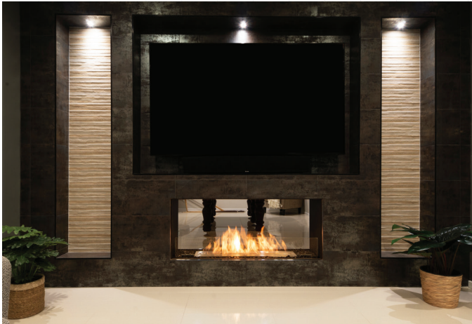
Flex 50DB (SIDE 1)