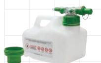
Jerry Can, Safety Spout & e-NRG bottle adaptor