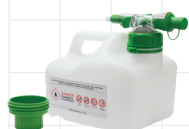
Jerry Can, Safety Spout & e-NRG bottle adaptor