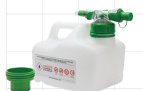
Jerry Can, Safety Spout & e-NRG bottle adaptor